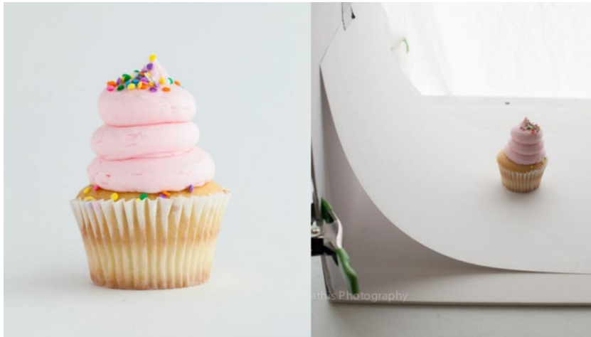
Photo from fstoppers.com, A portable and inexpensive seamless backdrop system , Taylor Mathis